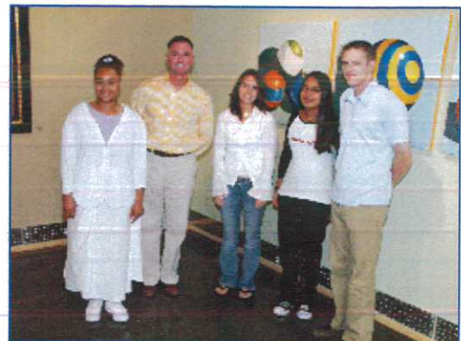
Summer Youth working at the Soicher Marin Fine Arts Gallery.