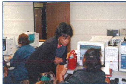
Congresswoman Maxine Waters' (35th District) recent tour of the South Bay One-Stop Business and Career Center, Inglewood location.