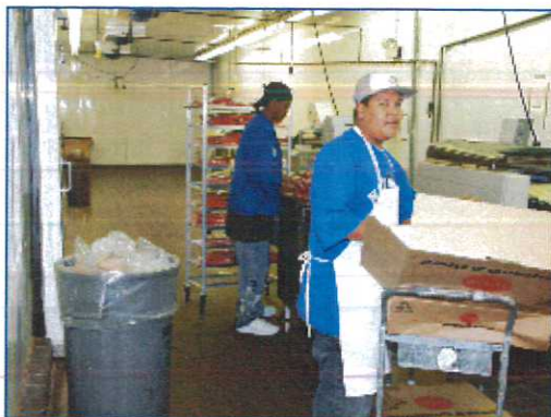
Summer Youth Worker at the Commissary of the U.S. Air Force Base in El Segundo.

The WIA Year-round Youth Development System achieved high ratings in exceeding all of the WIA performance measures for both younger and older youth.