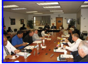
The South Bay Workforce Investment Board, Board of Directors.

The South Bay Workforce Investment Board (SBWIB) has been awarded $2,216,500 to assist over 400 workers. The funding will allow the SBWIB to provide services and training to dislocated workers to transition to a variety of high wage, high demand occupations.