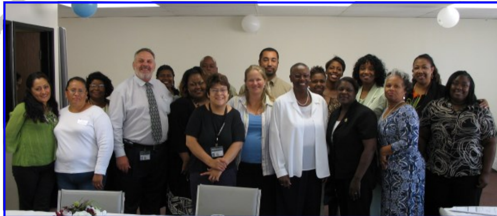
One-Stop staff and administration responsible for receiving the highest level of certification at the Inglewood location. The Gardena and Redondo Beach One-Stops also achieved the highest level of certification.