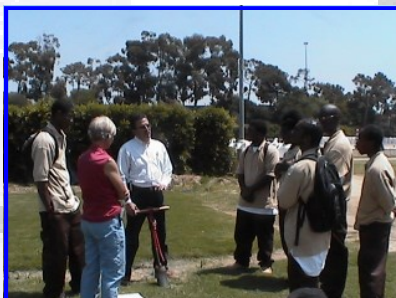
Students learn about turf maintenance in a training program sponsored by SBWIB, Cal State Dominguez Hills, EDD, and the West Basin Municipal Water District.

The South Bay Workforce Investment Board (SBWIB) received $25,000 from the West Basin Water District in support of the SBWIB's second year of its Turf Maintenance program. Additional funds were provided through the Department of Labor from SBWIB's successful Bridge to Work Program that Congresswoman Maxine Waters started with SBWIB two years ago. The Turf Maintenance program is an education and training program to meet the growing demand for a skilled and agile workforce in the turf maintenance and landscape industry. SBWIB in partnership with California State Dominguez Hills Extended Education Department and West Basin Municipal Water District combined classroom training with hands-on subsidized work experience to develop apprenticeship level skills.