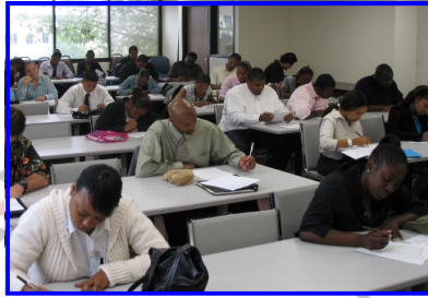
Potential employees for numerous job openings train and test their skills at the Inglewood One-Stop Location.

The three South Bay One-Stop Business and Career Centers serving the cities of Hawthorne, Lawndale, El Segundo, Inglewood, Hermosa Beach, Manhattan Beach, Redondo Beach, and Gardena underwent a rigorous on-site certification process during July of 2006. Each center attained the highest level of certification.