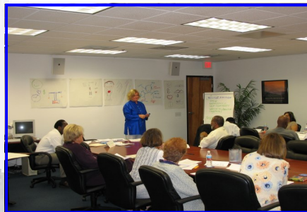
Blueprint for Customer Service Success workshop hosted by the South Bay Workforce Investment Board.

Blueprint for Customer Service Success is an innovative, first of its kind program, that was the result of a unique collaboration with a local school district. The South Bay Workforce Investment Board and the South Bay Business Resource Network joined with the Centinela Valley Adult School to develop curriculum and materials for this valuable program to assist local businesses and their employees provide exceptional customer service.