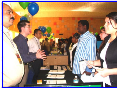
Youth job seekers speak with representatives from local businesses at the Youth Job Fair hosted by the SBWIB.

On April 6, 2006, the Hawthorne Memorial Center hosted 50 local employers including Sears, Department of Rehabilitation, Universal Studios, Comcast, Macy's, Fed Ex, HMS Host, Pacific Theaters, Juice-It-Up, SCORE Education, Larger Sizes, Macy's, Daniels Jewelers, and AMC Theaters, and the LAX Marriott Hotel. Chartered buses transported an estimated 600 students from area high schools to the Job Fair.